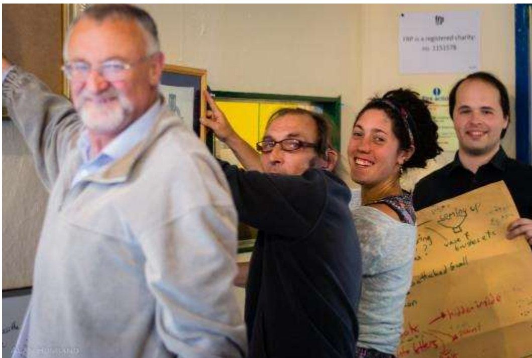
Some of our staff and volunteers at FRP's reclaimed paint shop

FRP has received funding from City Bridge Trust to develop its volunteer programme. Building on our experience over many years of working with volunteers, the Environmental Action Through Volunteering Project is developing new and innovative approaches to maximise the benefits of volunteer placements and improve the overall volunteering experience. Volunteers access skills and activities based learning, capture their own learning and skills development, and are active in their local community to improve the environment and reduce carbon emissions. FRP is immensely grateful to all its volunteers for their time, commitment, work and enthusiasm.