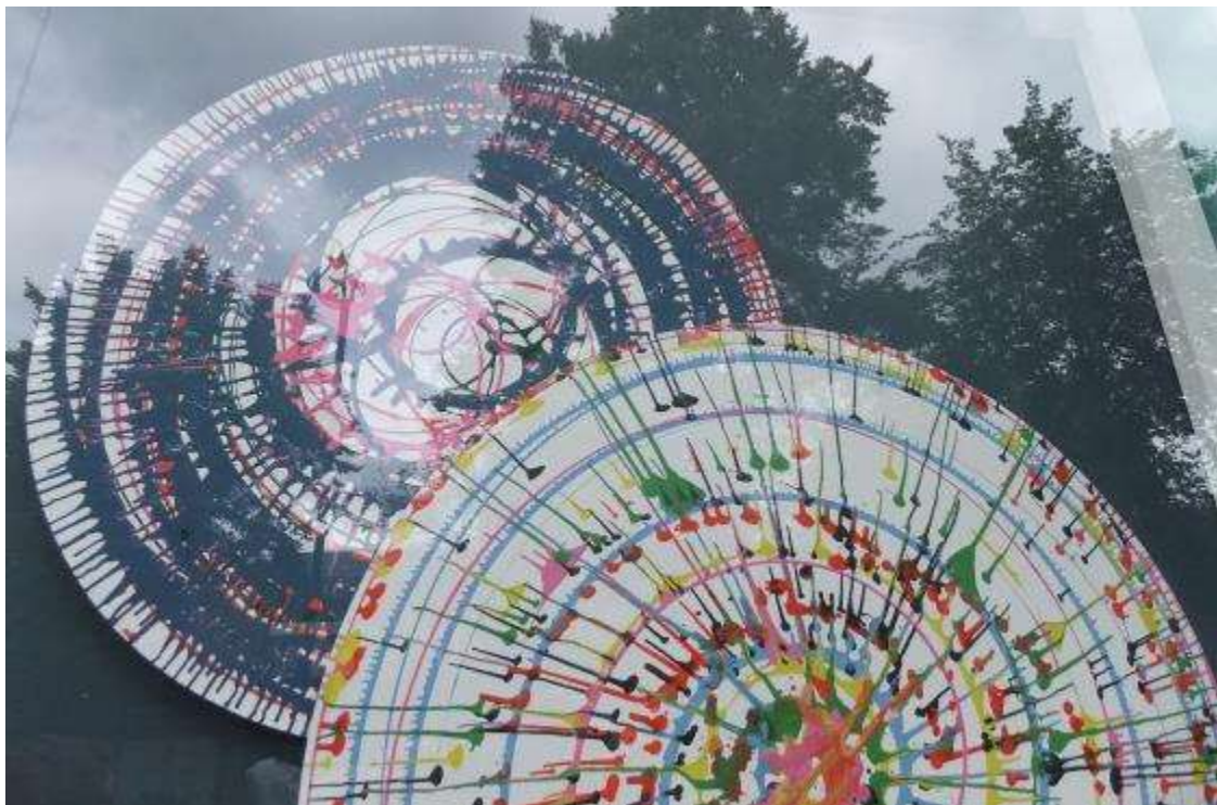
Detail from our exhibition of spin paintings at the Slate Gallery in Leytonstone