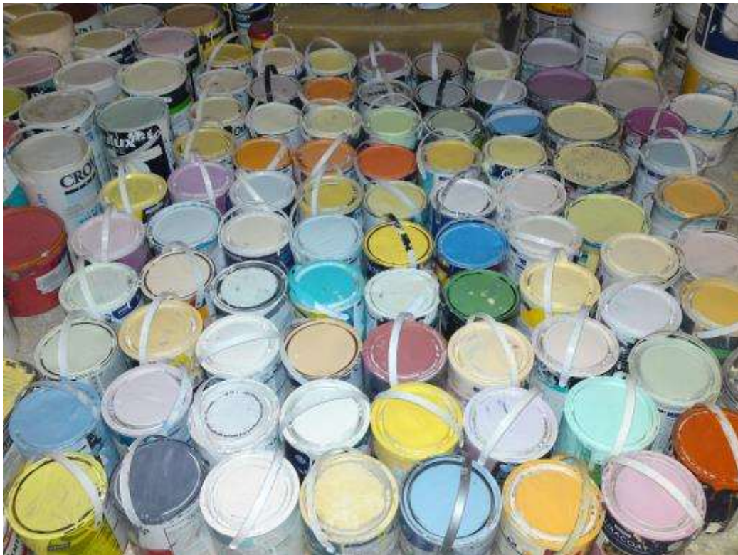
A colourful selection of our reclaimed paint