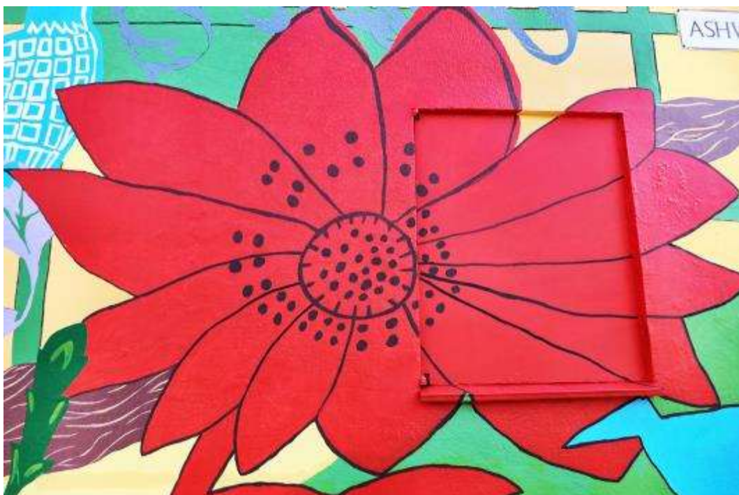
Detail from our community mural project at Hatch Lane, Chingford

City Bridge Trust awarded us a £81.4k grant over 2 years to enhance our volunteer programme.