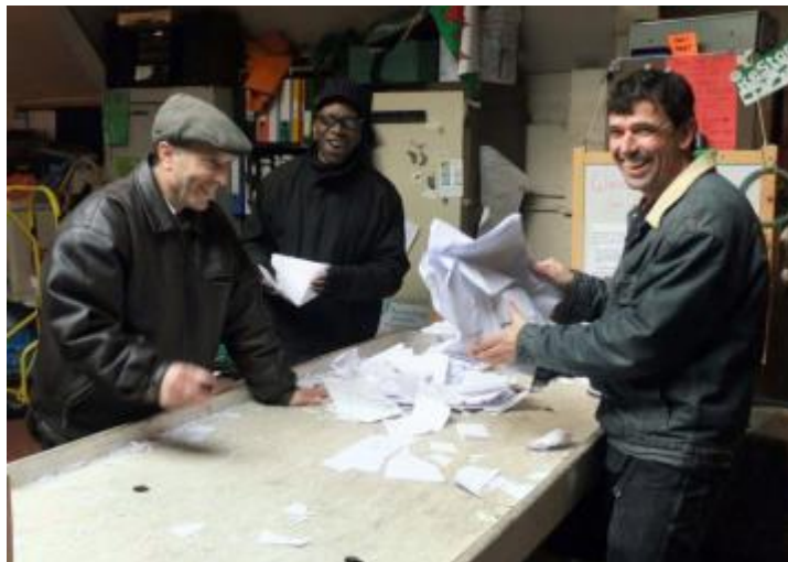
Green Office volunteers at work

FRP collects office paper for recycling from small businesses and not-for-profit organisations within the London Borough of Waltham Forest and adjoining areas. Both a normal and confidential waste paper collection service is provided. We also collect small amounts of cardboard, and sell 100% recycled, A4 white paper for everyday office use.