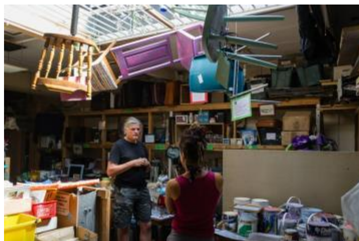
Upcycled chairs on display at FRP

FRP organised 'Get Upcycling', a furniture recreation competition to excite people by the possibilities and environmental benefits of second-hand, re-use furniture and highlight the need to be resourceful with waste materials. The competition saw entries from across London with pieces temporarily exhibited at The Mill community space in Coppermill Lane.