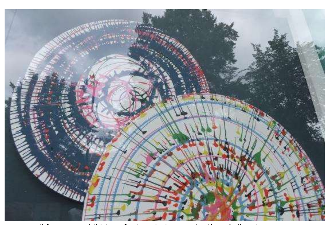
Detail from our exhibition of spin paintings at the Slate Gallery in Leytonstone