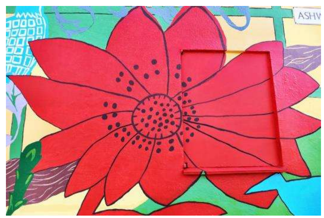
Detail from our community mural project at Hatch Lane, Chingford

City Bridge Trust awarded us a £81.4k grant over 2 years to enhance our volunteer programme.