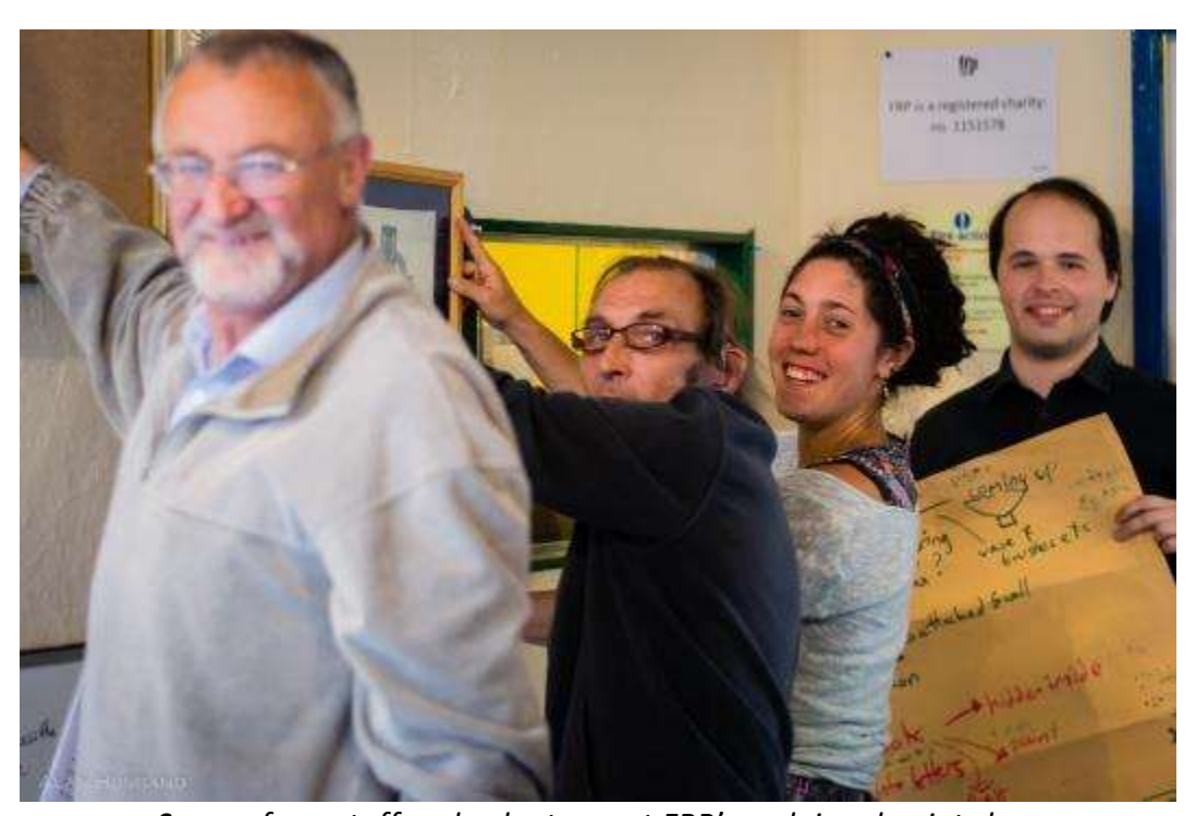
Some of our staff and volunteers at FRP's reclaimed paint shop

FRP has received funding from City Bridge Trust to develop its volunteer programme. Building on our experience over many years of working with volunteers, the Environmental Action Through Volunteering Project is developing new and innovative approaches to maximise the benefits of volunteer placements and improve the overall volunteering experience. Volunteers access skills and activities based learning, capture their own learning and skills development, and are active in their local community to improve the environment and reduce carbon emissions. FRP is immensely grateful to all its volunteers for their time, commitment, work and enthusiasm.