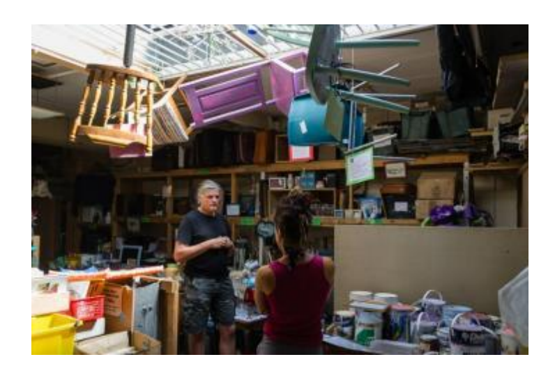
Upcycled chairs on display at FRP

FRP organised 'Get Upcycling', a furniture recreation competition to excite people by the possibilities and environmental benefits of second-hand, re-use furniture and highlight the need to be resourceful with waste materials. The competition saw entries from across London with pieces temporarily exhibited at The Mill community space in Coppermill Lane.