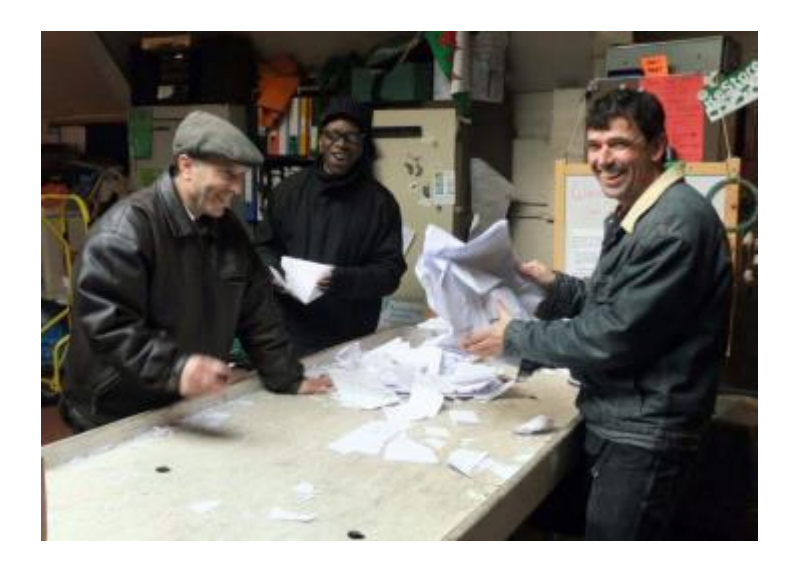
Green Office volunteers at work

FRP collects office paper for recycling from small businesses and not-for-profit organisations within the London Borough of Waltham Forest and adjoining areas. Both a normal and confidential waste paper collection service is provided. We also collect small amounts of cardboard, and sell 100% recycled, A4 white paper for everyday office use.